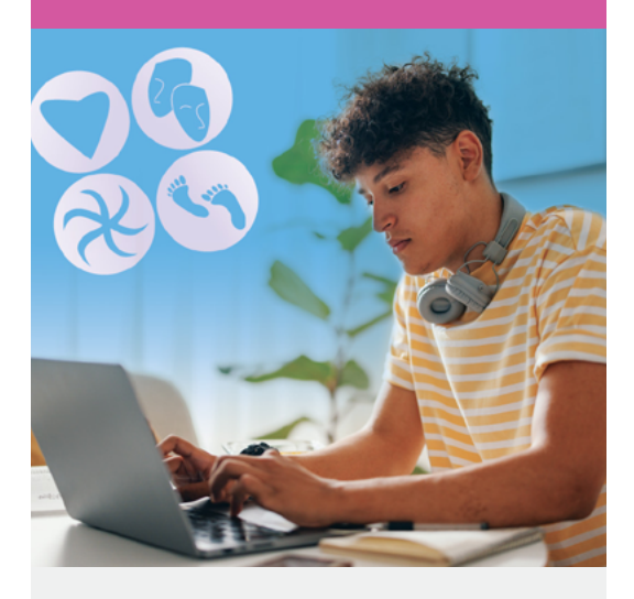
For a quick program evaluation, try using Head Heart Feet Spirit sheet